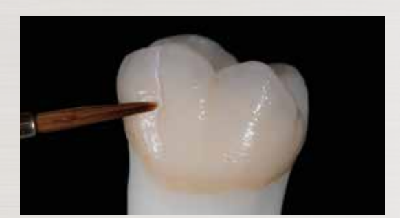
Shade effects in the layering technique