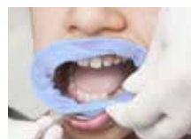
Placement behind the lower lip