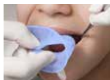
Insertion in the left corner of the mouth