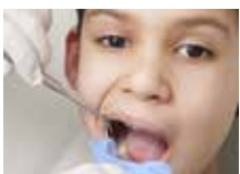
A relaxed mouth makes placement easier