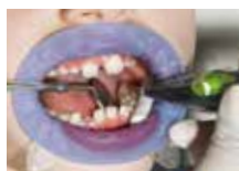
Restorative treatment in children