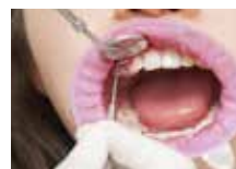
Diagnostics in children