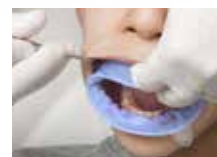
Placement behind the upper lip