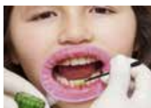
Professional care in children