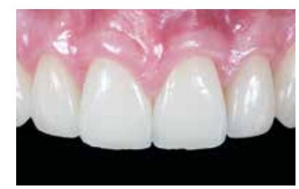
After 10 years in situ