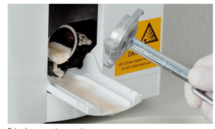
Extra large service opening